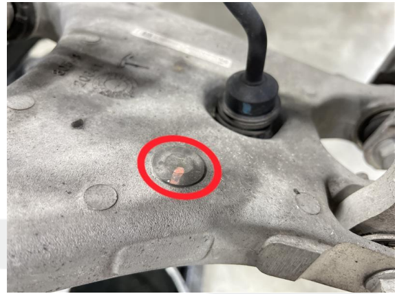
Figure 2 – RH