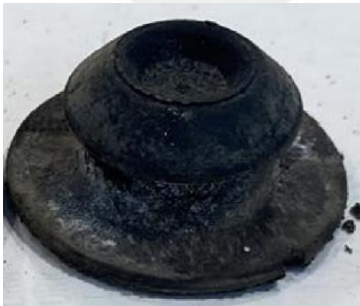
Figure 3 – Pass