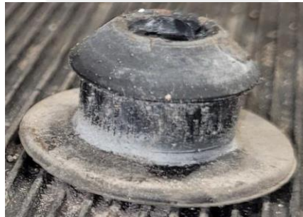
Figure 4 – Pass: Limit of allowable salt deposits