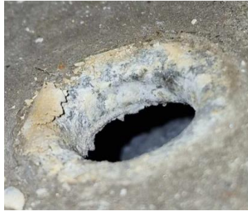
Figure 7 – Fail