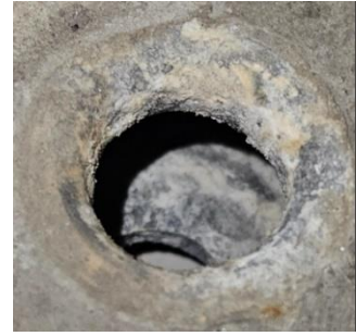
Figure 8 – Fail