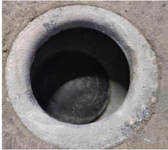
Figure 6 – Pass