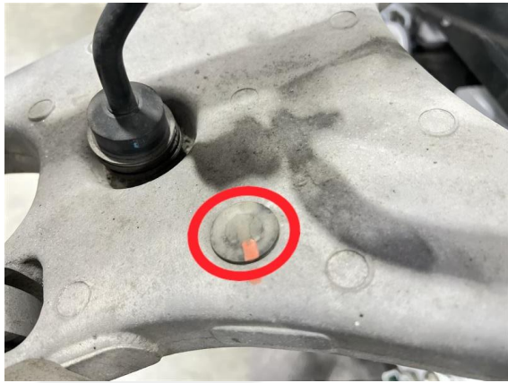
Figure 1 – LH