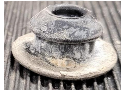
Figure 5 – Fail